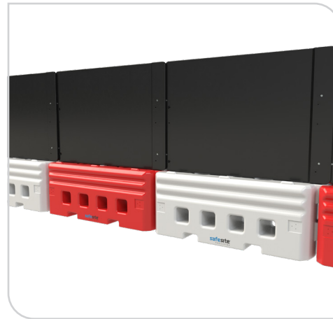
Barrier Hoard installed with RB22